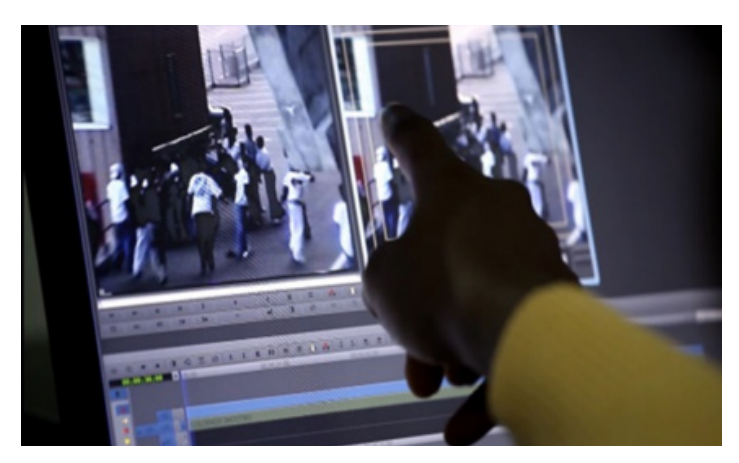
GPF Forensic Video Analysts compares images from a crime scene

Public engagement is critical for effective functioning of a criminal justice system. Public Service Announcements developed by JES have had more than 30,000 views on the Guyana Police Force Facebook page, reaching members of the public with important messaging on their role in the justice system.