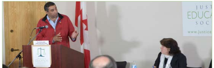
Left: Audience members and cameras watch Judge de Couto ask panelists a question at Gang Wars: Justice In Our Times.